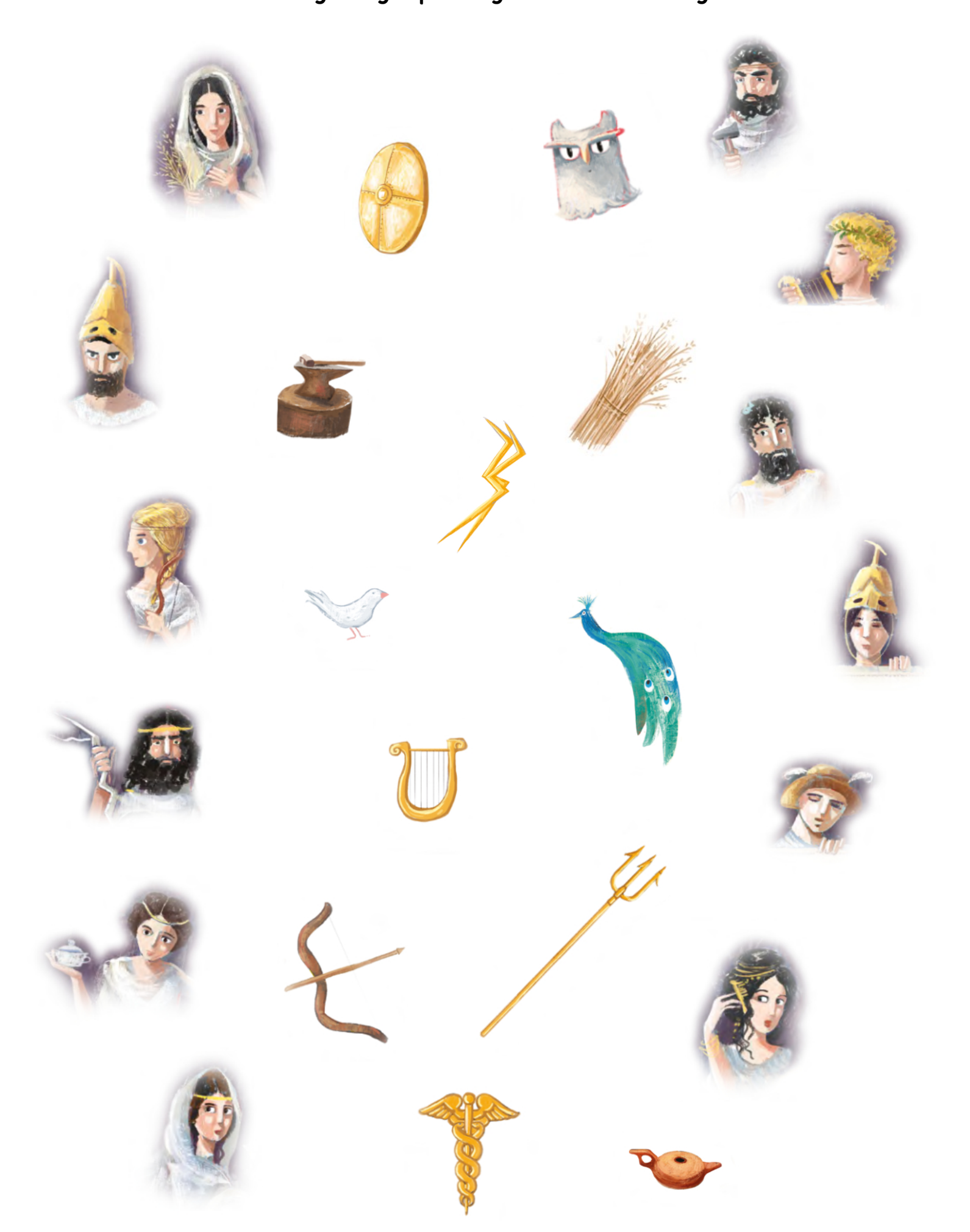
Link every Olympian god to his/her symbol